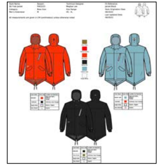
Flats & Techs