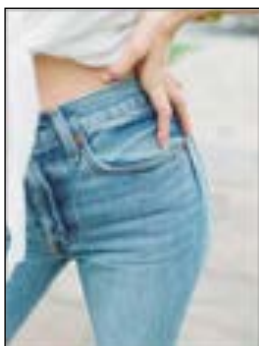
Pants & Jeans