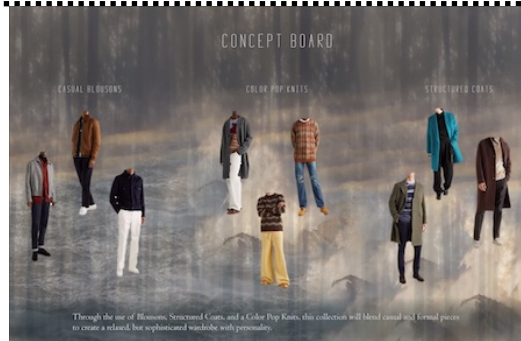
Concept & Development