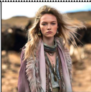
AI & Fashion Design