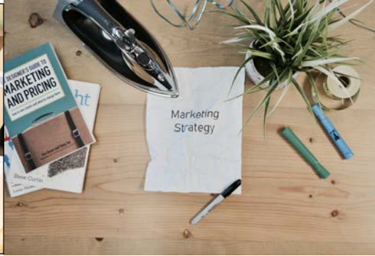
Marketing & Branding