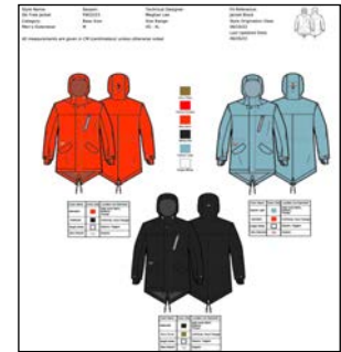
Flats & Techs