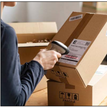
Supply Chain Mgmt