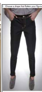
Fit & Alteration