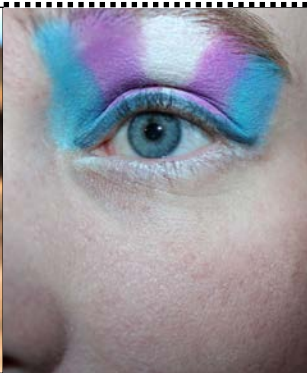
Gender & Fashion