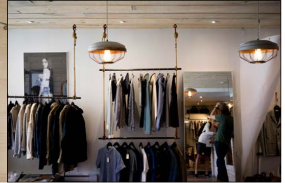
Buying & Merchandising