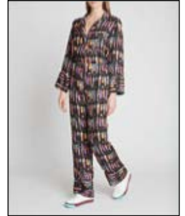
Computer Print Design