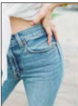
Pants & Jeans