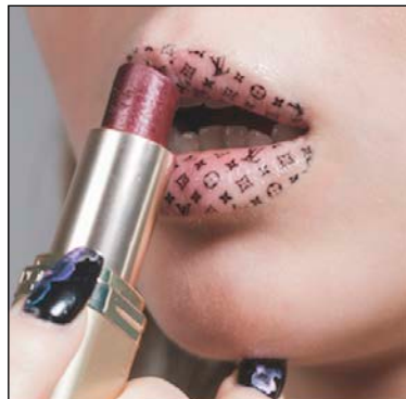
History of Fashion