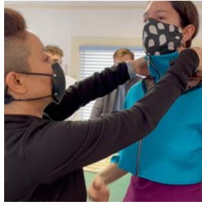
Fit & Pattern Alteration