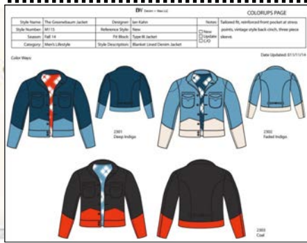
Flats & Techs