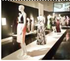
Inside the Fashion Industry