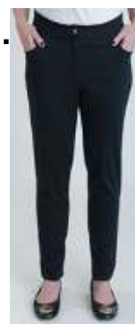
Pants & Jeans