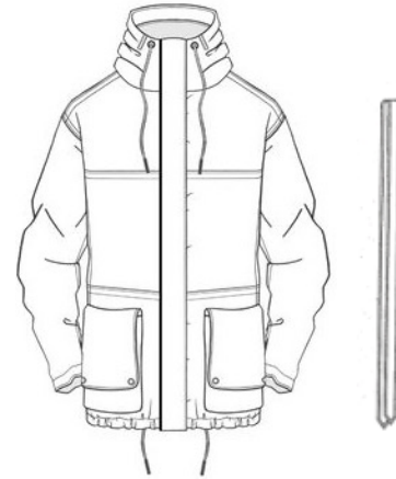
#3610- Marguerite Parka with cargo pockets, funnel neck, hidden hood and optional belt